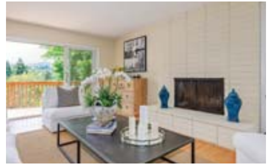
8 FLEETWOOD COURT, ORINDA | SOLD AT $1,316,250 REPRESENTED THE BUYERS